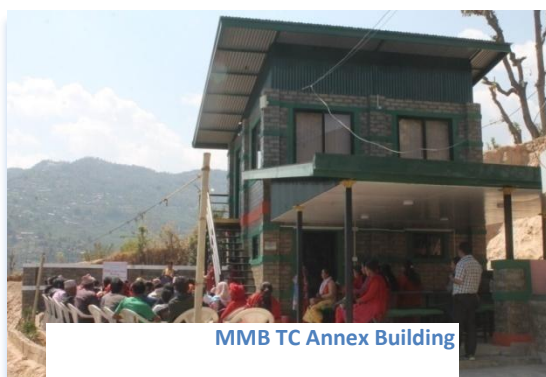
MMB TC Annex Building

In cooperation of MMB Foundation, Stuttgart, Germany, GNHA constructed the Annex building of MMB Training Center. The Annex building is constructed using diverse technology and materials. Foundation is constructed with stone cement masonry, the wall above the plinth level is constructed with interlock bricks. The building with TRUSS structure; slab is casted with heavy metal reinforcement with PCC casting. The protection wall is constructed with the sacks of earth filling. The Annex building is used for store, dinning for the trainees for their day snacks and dormitory space while extremely busy occupancy.